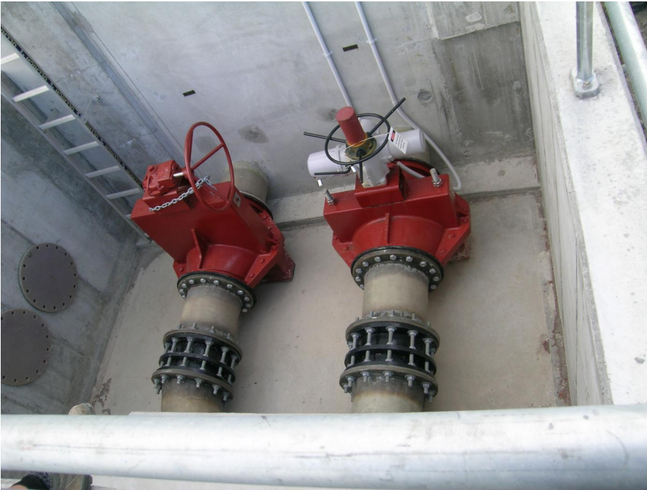
DN300 outlet spools connecting to valves and buried pipe.